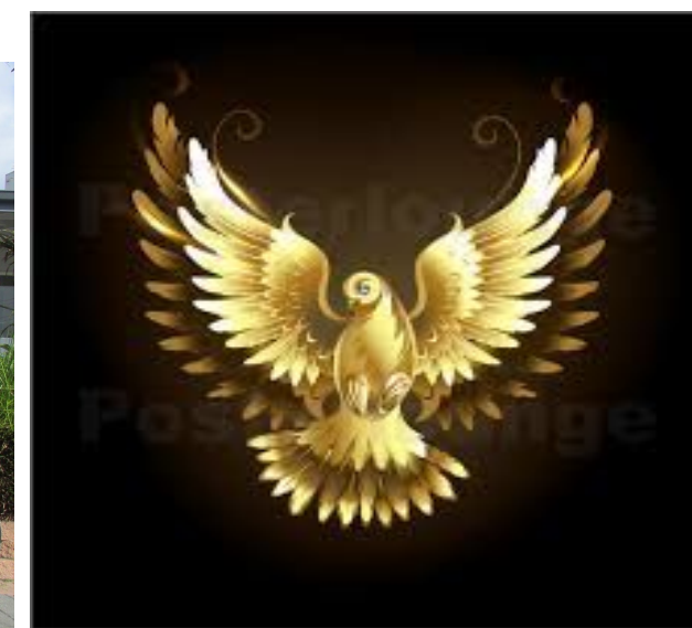
(Room 16 - Golden Doves)