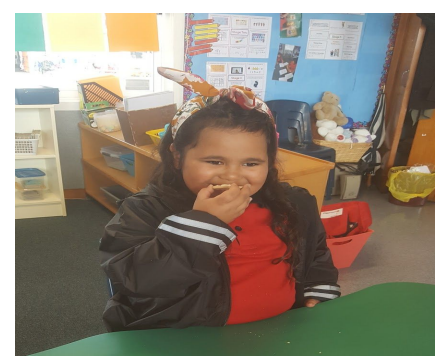
Eating the butter on the cracker. (Gwenavea)

First, we poured the cream into the glass jar. Next, we took turns shaking the glass jar in a circle. Finally, we ate the butter with some crackers. The crackers were hard and delicious when we ate it. It tasted a bit creamy and it was smooth. By: Faiupu