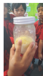
Holding the butter in the jar.