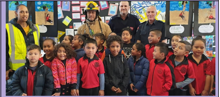
Super Sharks meeting the firemen in the truck and asking questions.