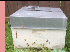
Bee Hive Just moved in!!

The Fire Truck featuring the JUNIORS and two lucky students from