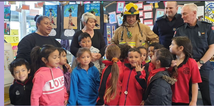
Fearless Explorers paying great attention to the firemen coming to visit them.