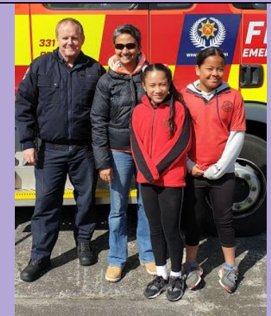
Group photo with one of the members in the firetruck.