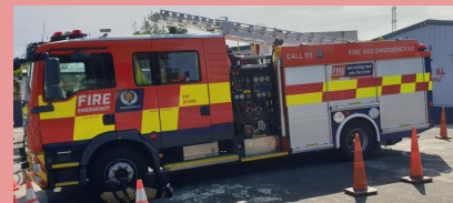
the tuff techs / Room 19

The Fire Truck featuring the JUNIORS and two lucky students from